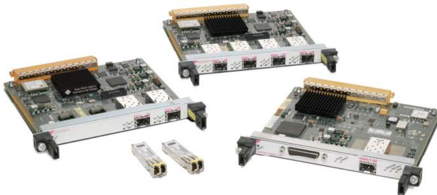
Figure 1. Cisco 2-Port OC-48c/STM-16c POS/RPR SPA with SFP Optics

The Cisco 1-, 2-, and 4-Port OC-48c/STM-16c POS/RPR SPAs are available on high-end Cisco routing platforms and offers the benefits of network scalability with lower initial costs and easy upgrades. The SPAs continues the Cisco focus on investment protection along with consistent feature support, broad interface availability, and leading-edge technology. The SPAs allow different interfaces (POS, ATM, etc.) to be deployed on the same carrier card.