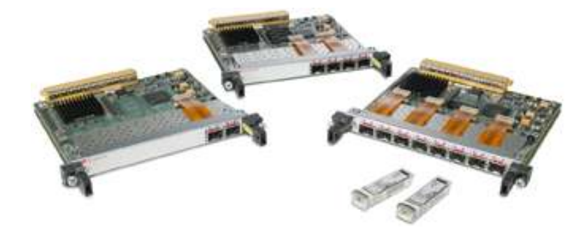
Figure 1. Cisco 2/4/8-Port OC-12 POS SPAs with SFP Optics

The Cisco<sup>®</sup> I-Flex design combines shared port adapters (SPAs) and SPA interface processors (SIPs), using an extensible design that enables service prioritization for voice, video, and data services. Enterprise and service provider customers can use the improved slot economics resulting from modular port adapters that are interchangeable across Cisco routing platforms. The I-Flex design maximizes connectivity options and offers superior service intelligence through programmable interface processors, which deliver line-rate performance. I-Flex enhances speed-to-service revenue and provides a rich set of quality-of-service (QoS) features for premium service delivery while effectively reducing the overall cost of ownership. This data sheet contains the specifications for the Cisco 2/4/8-Port OC-12c/STM-4 Packet over SONET SPAs (Cisco 2/4/8-Port OC-12 PoS SPAs; refer to Figure 1).