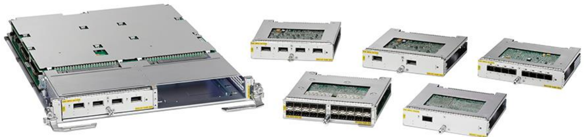
Figure 1. Cisco ASR 9000 Series Modular Line Cards

Using the modular line cards, the Cisco ASR 9000 Series can support customer applications including video-on-demand, Internet Protocol Television (IPTV), point-to-point video, Internet video, and cloud-based computing. These line cards can also be used to deliver economical, scalable, highly available, line-rate Ethernet and IP/Multiprotocol Label Switching (IP/MPLS) edge services. The Cisco ASR 9000 Series line cards and routers are designed to provide the fundamental infrastructure for scalable Carrier Ethernet and IP/MPLS networks, supporting profitable business, residential, and mobile services (Figure 1).