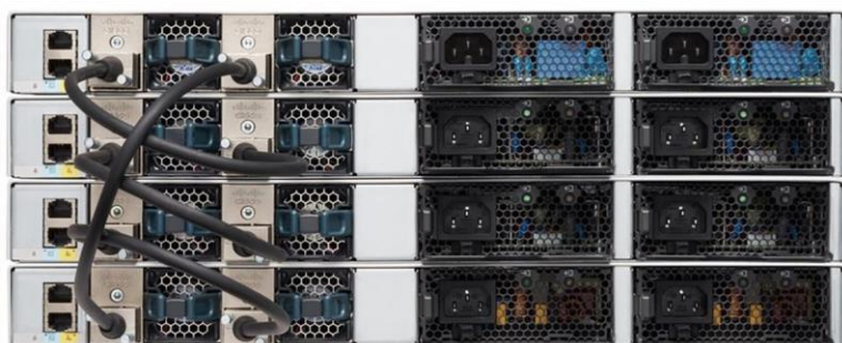
Figure 4. Cisco Catalyst 9200 Series Switch stacked units