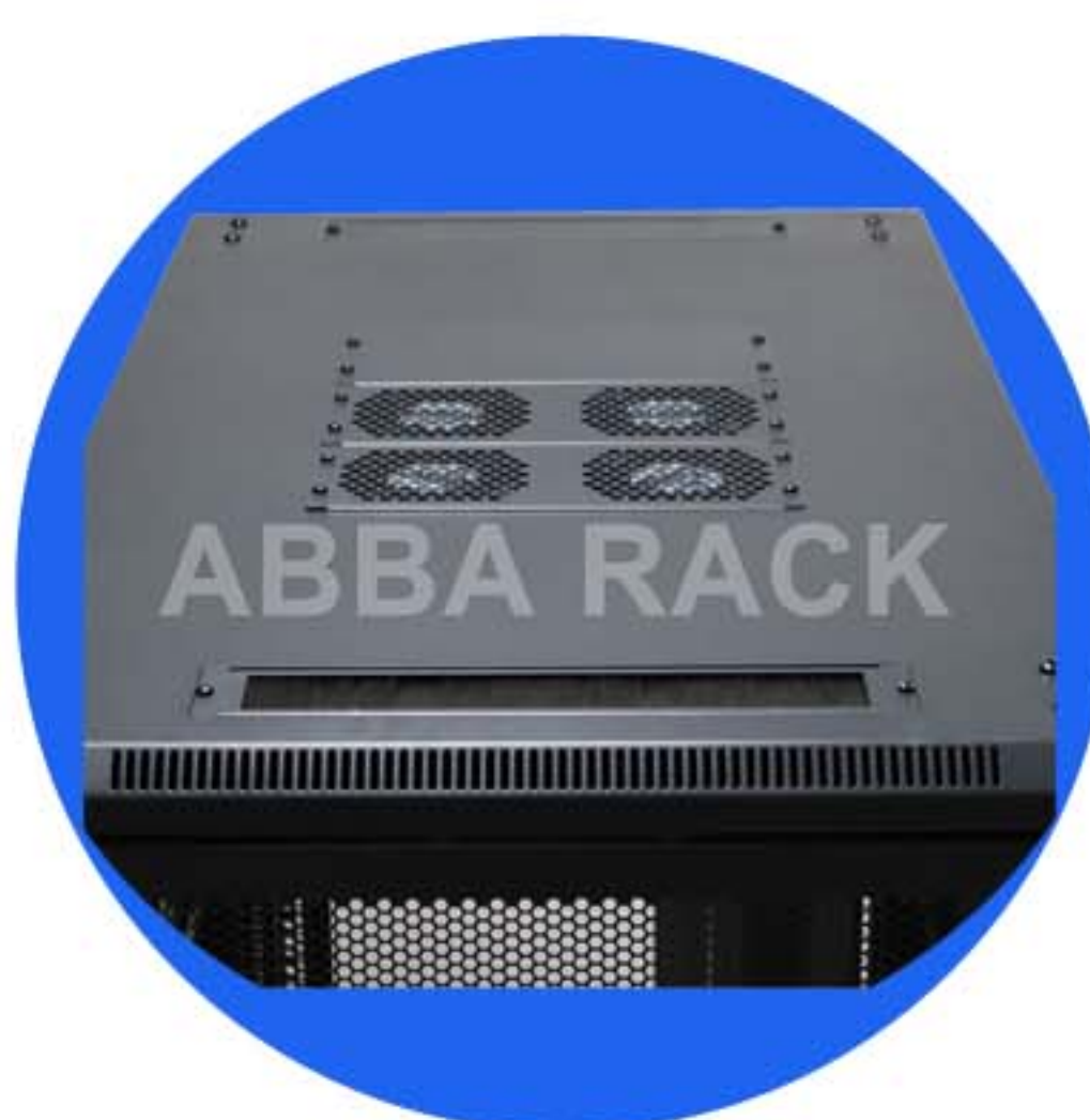
Modular Fan & Brush panel