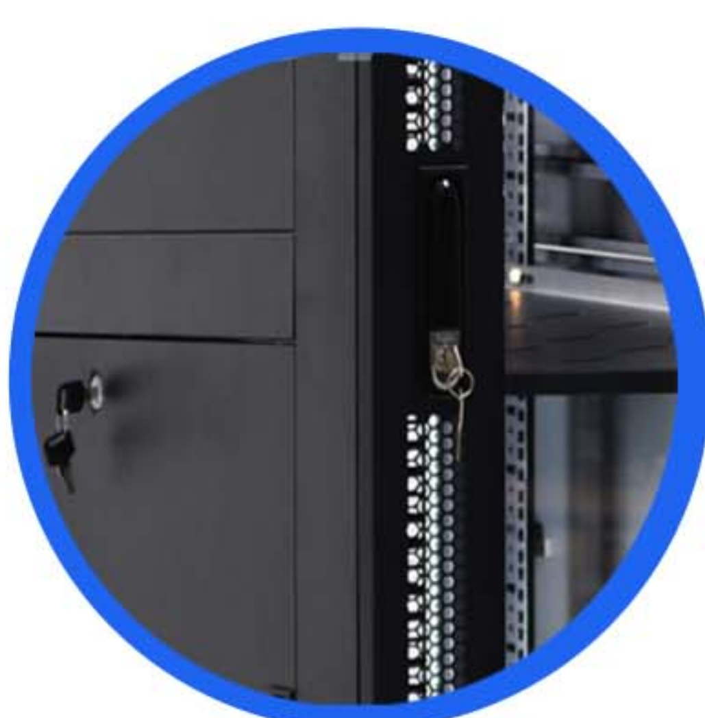
Handle Front & Rear w/ Hexagon Vented