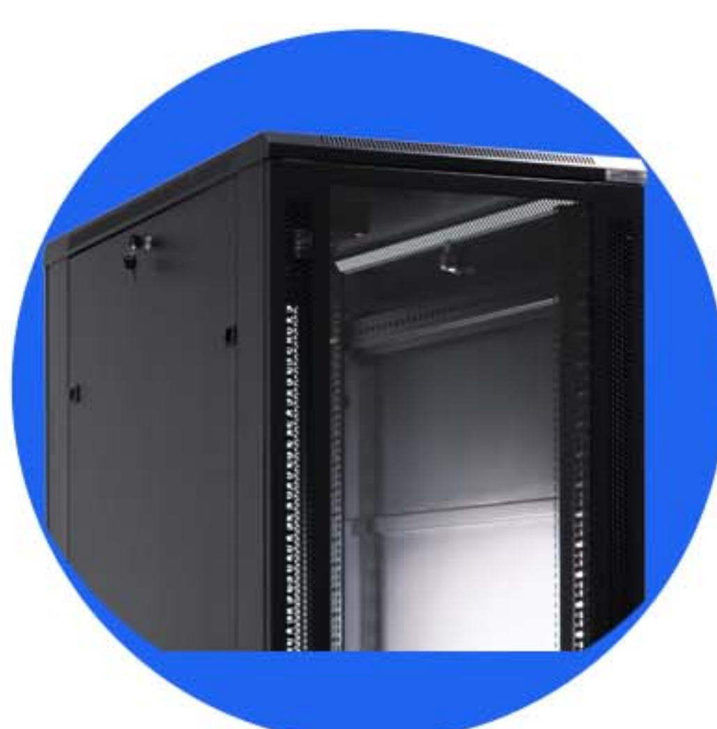
Dual side panel w/ locking system