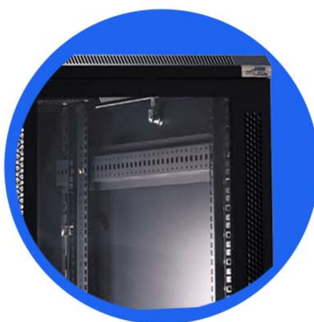
Glass front door Top & bottom vented