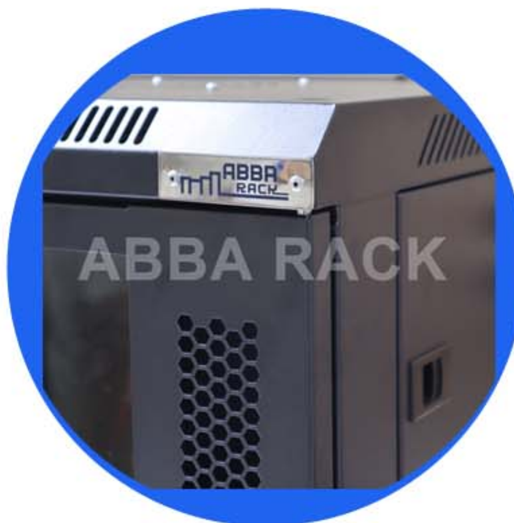
Acrylic front door Top & bottom vented