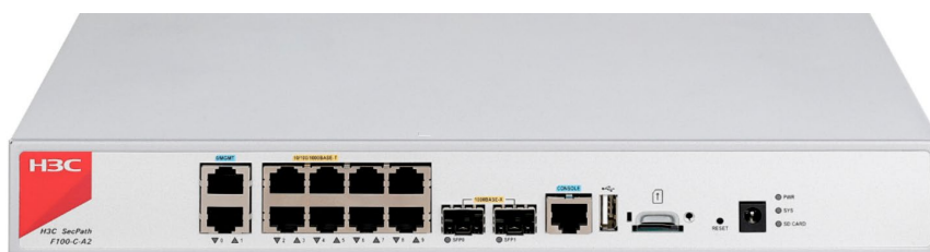
H3C SecPath F100-C-A2 firewall