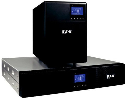
9SX Rack & Tower models

700/ 1000/ 1500/ 2000/ 3000/ 5000/ 6000 VA