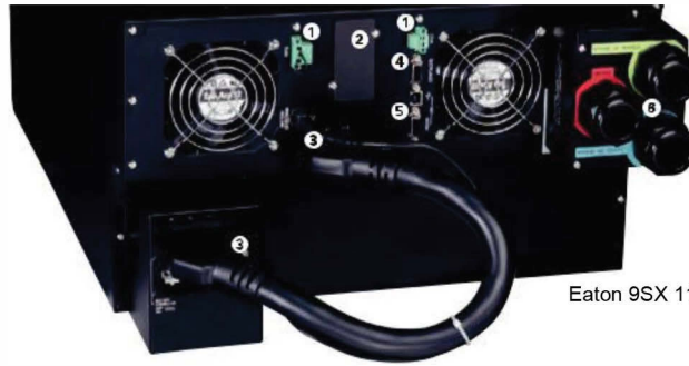
Eaton 9SX 11 kVA