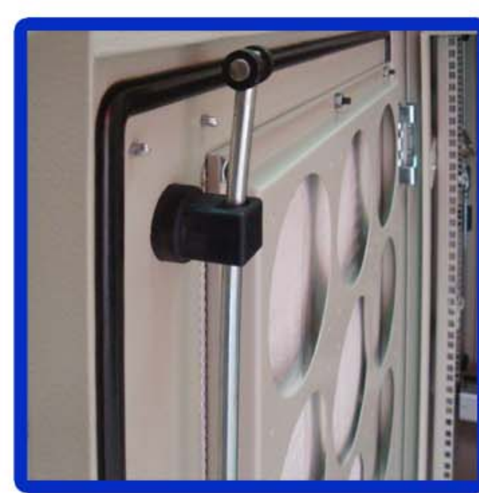
Door Gasket & Lock