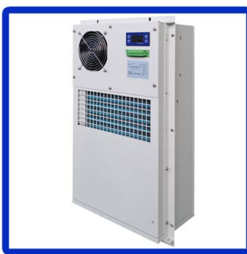
Air Conditioner AC/DC