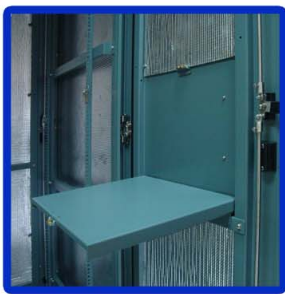
Laptop & Paper Patch